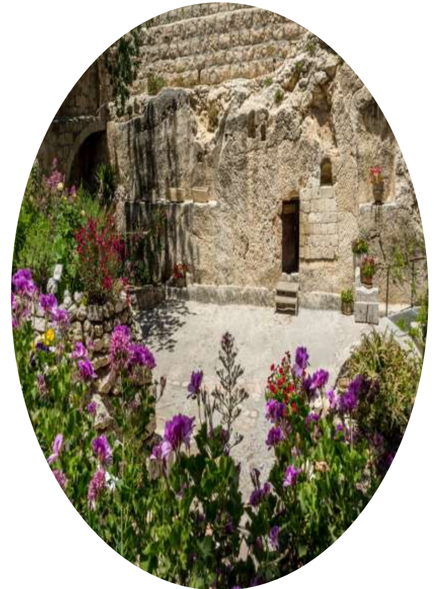
Gordon's Tomb, Jerusalem

75 McCutchen Street PO Box 472 Ellijay, GA 30540 706-635-2555